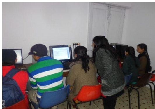
Training Program in Progress