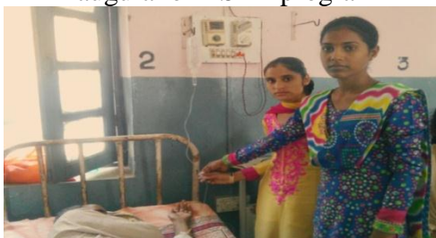
Trainees at hospital