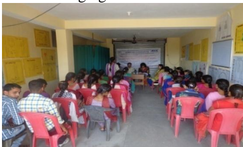
Inaugural of BSPA program

An orientation workshop for mobilization of beneficiaries was organized at Block Office Jhandutta, on 4 th August, 2015 in which 55 people participated where they were made aware of different schemes of the Government for self/ wage employment, financial assistance etc. The road shows for awareness were conducted in 48 Panchayats of Block Jhandutta, District Bilaspur. The areas were Amarpur, Jhandutta, Samoh, Bharti, Rohal, Badol, Gharan, Behna Jatta, Behna Brahmna etc. The Skill Development Training Programme for assured employment on Bed Side Patient Attendant was held from 17 th August, 2015, where 25 beneficiaries belonging to Scheduled Caste Category were selected.