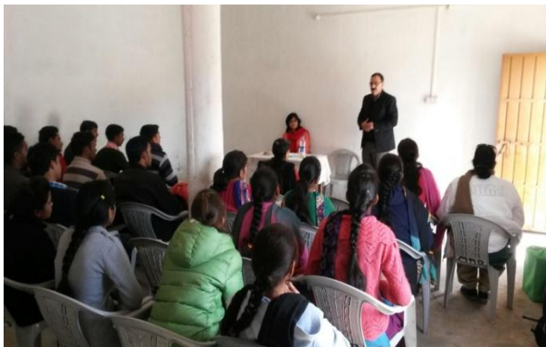
Inaugural function of Mobile Phone Repair at Dharampur

The training project on Mobile Phone Repairing trade was for duration of one month for SC Category youth in Dharampur Block of Solan District. 25 candidates from various areas of Dharampur Block viz Dharmpur, Kumharhatti, Gulhari, Garkhal, Kasauli, Rouri, Bathol, Kanda, Bholi etc. were selected for this program. The Skill Development Training programme was held at HIM Educational Institute, Dharampur.