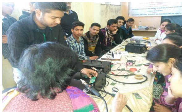
Training Program in Progress