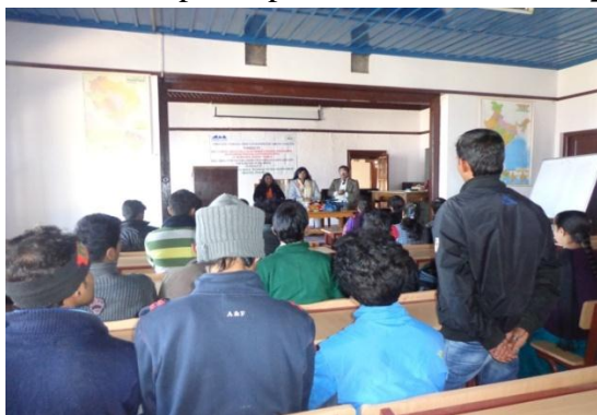
Inaugural Function of BPO training at Mashobra

25 candidates were selected for this program from various areas of Mashobra Block viz Dhalli, Mashobra, Gumma, Mulkoti, Tutu, Kufri, etc. The training course was held at the HPSCTF Training Hall, Mashobra for duration of one month. The training course included rigorous theoretical lectures as well as practical classes for the trainees. After completion of one month training, M/S Competent Synergies Pvt. Ltd., C-157, Sec-67, Industrial Area, SAS Nagar, Mohali, Punjab conducted campus interview and selected 21 trainees for employment in their organization. Out of a total of 25 participants trained, 21 were placed which is 84% of the total persons trained.